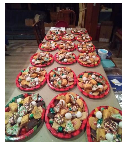
Christmas cookie plates: an annual tradition.