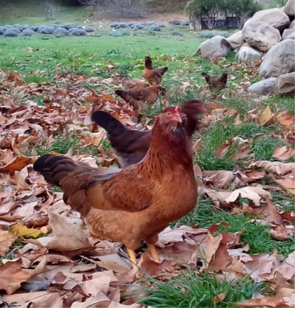
Big Bertha, our largest young hen, is also one of our gentlest.