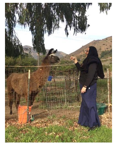
Saying hello to our friendly neighborhood llama.